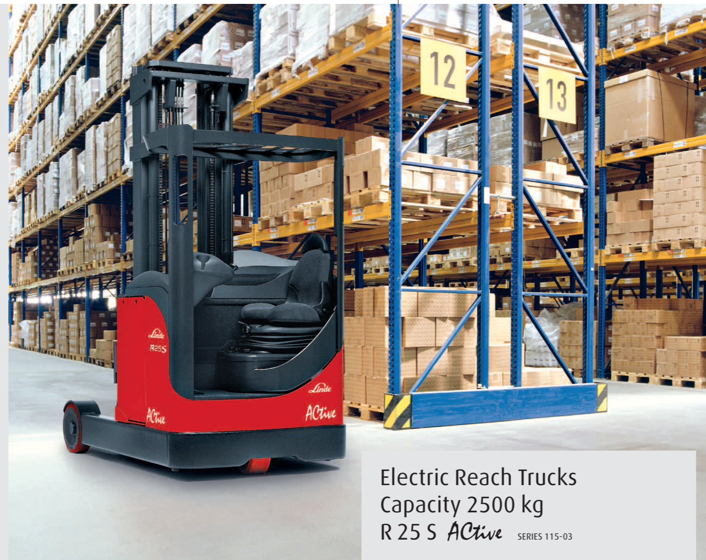
Electric Reach Trucks Capacity 2500 kg R 25 S Active SERIES 115-03